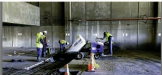
GSA - Design/Build Replacement of Domestic Water & Sanitary Waste Lines at RC White Building - El Paso, TX

BONDING CAPACITY $5 MILLION SINGLE $10 MILLION AGGREGATE 236220 COMMERCIAL CONSTRUCTION