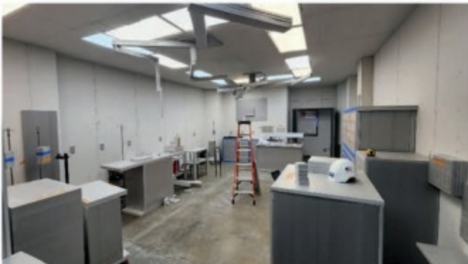
USACE - VA El Paso New Healthcare Facility Mockups for Clark Construction