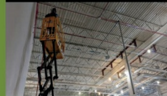
USACE - DESIGN - BID - BUILD B1717 FREEZER CONSTRUCTION AT FORT BLISS