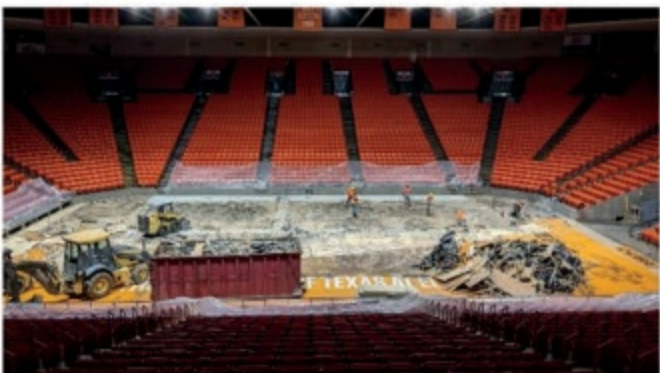
University of Texas at El Paso - Don Haskins Special Events Center Subsurface Improvements