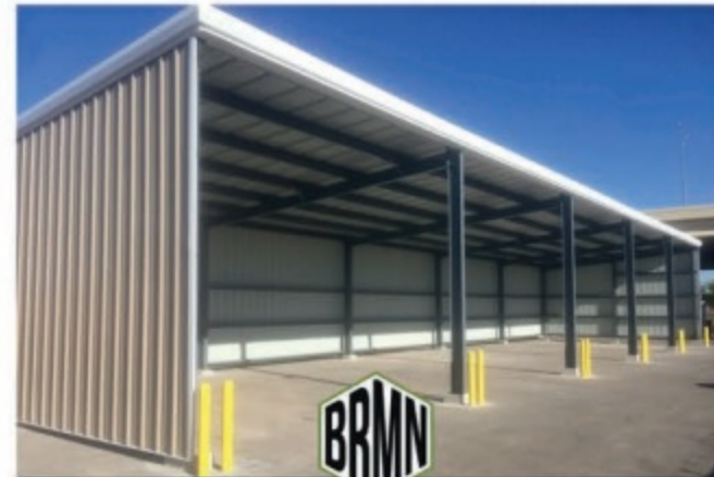
VA - DESIGN/BUILD EQUIPMENT SHELTER AT FORT BLISS NATIONAL CEMETERY